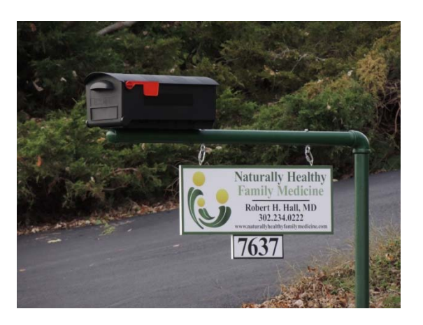
Headed northwest on Route 41